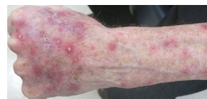
Figure 1. Papulopustular eruption from EGFRI.

Simple approaches like mild soaps and daily moisturizers are commonly only employed once cAEs are encountered; in fact, Drs. Lacouture and McLellan noted up to 84% of cAEs are never referred to a dermatologist; among patients that consult dermatologists, most are seen after the onset of expected cAEs, rather than prophylactically. Reasons for this include the time delay to see a dermatologist, associated costs, and the lack of knowledge of dermatology as a resource. 13,14 Dr. Lacouture indicated that prior to head and neck radiation or stem cell transplants, patients generally receive a dental evaluation due to the high occurrence of oral adverse events and that such practices are warranted for dermatology as well. The USCOM algorithm importantly suggests measures to take before, during, and after cancer treatments, as well as gradation based assessments for determining the type, severity, and treatment of cAEs. 1